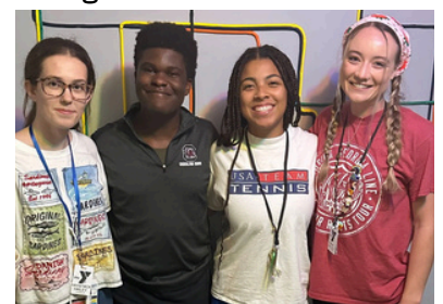
YMCA Summer Camp Staff: