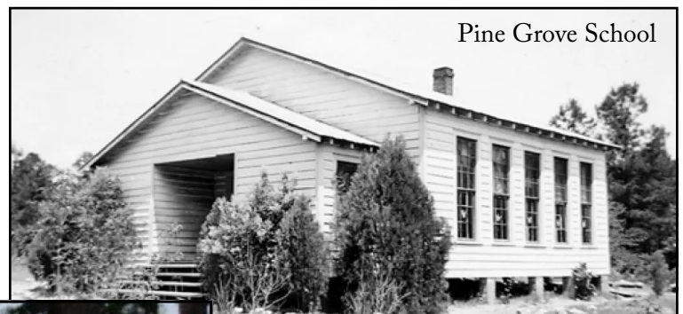
Pine Grove School

In July 2023, members of WSUMC's Racial Justice Action Team visited the Pine Grove School. During this visit, a former student joined the group and shared her perspective on how important these schools were to the students and the community. Additional information learned during visit: