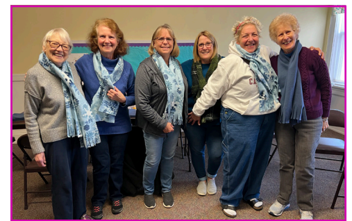
Tabitha's Table crew poses with scarves.