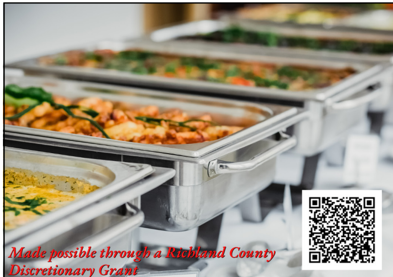
Made possible through a Richland County Discretionary Grant