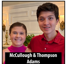
McCullough & Thompson Adams