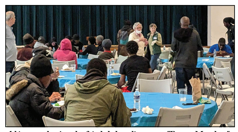
A big crowd enjoyed a fried chcken dinner on "Easter Monday."

March 19: 167 (in-person); 134 (online) = 301