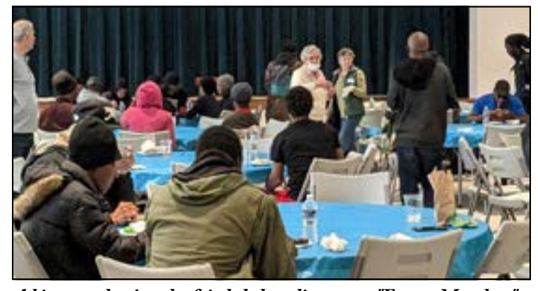
A big crowd enjoyed a fried chcken dinner on "Easter Monday."

March 19: 167 (in-person); 134 (online) = 301