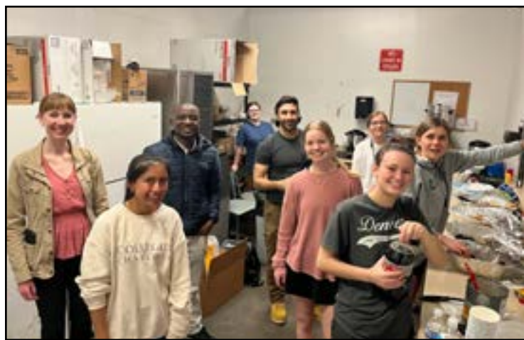
MSN at winter shelter doing a Fat Tuesday pancake dinner for the patrons

Washington Street UMC has been an incredible support and partner in ministry for the Wesley Foundation/MSN over the years. Sunday School classes and the UMW from Washington Street have provided Sunday evening meals for students and have worshipped with MSN. The Missions committee has been very supportive, and MSN's mission trips to Ecuador have been a springboard for Washington Street. Many Washington Street members have been on the Wesley Foundation board over the years. Truly, this has been a shared and partnered ministry. How grateful we are at MSN for Washington Street UMC. To see more photos of MSN in action, please visit our Facebook page!