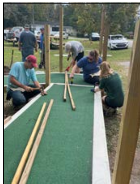
MSN builds handicapped ramp during spring break.

There are typical activities such as worship (though done a little differently, and on Sunday evenings), small groups facilitated by students, and bible study. Covenant discipleship groups often form a good model of how we do Christianity at MSN. Worship is a mainstay but personal devotion and growth are encouraged. The several retreats each year help with this growth, as well. But there is also equally a big emphasis on serving others in acts of compassion. We have traveled to many Latin American countries and to several countries in Africa offering health clinics and working with local churches. Several years ago, Washington Street and MSN traveled together on a mission trip to Brazil. We have been to many hard-hit areas of the USA doing service work. We traveled to the Gulf Coast more than 20 times after Hurricane Katrina and to the Sea Islands near Charleston many times. MSN also engages the big social issues through justice work, trying to understand and address structural injustice and sin. Students are passionate about