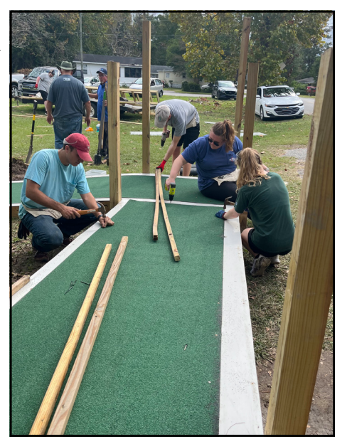
MSN builds handicapped ramp during spring break.

There are typical activities such as worship (though done a little differently, and on Sunday evenings), small groups facilitated by students, and