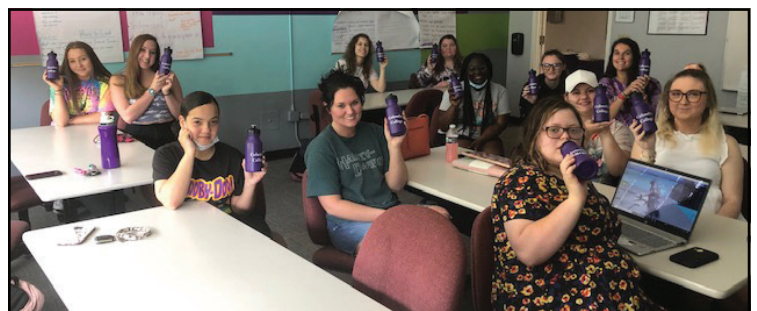
WSUMC's Active Faith donated water bottles to Columbia College Students.