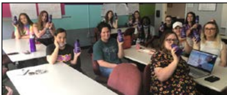
WSUMC's Active Faith donated water bottles to Columbia College Students.

This will be an experience of pilgrimage, of prayer, and a journey through the life of Modjeska Simkins, a civil rights icon in SC. After the tour, there will be a time for discussion and reflection.