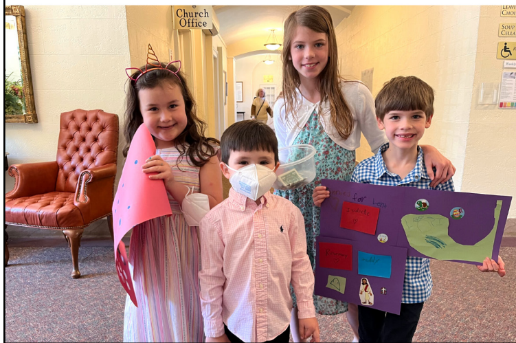
Our youth always have fun!