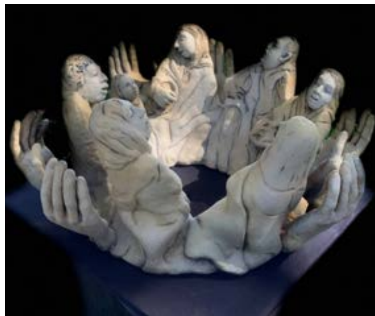
One of over 100 nativity displays that will be featured at the 2021 Festival.

Mepkin Abbey is a community of Roman Catholic Monks established in 1949 on the site of Historic Mepkin Plantation located on the Cooper River. This event is highly rated on Trip Advisor. You will experience over 100 nativity scenes from all over the world. In addition to the exhibit, you will experience the peace of the Monastic traditions, the lovely gardens, live oaks, sculptures and statues.