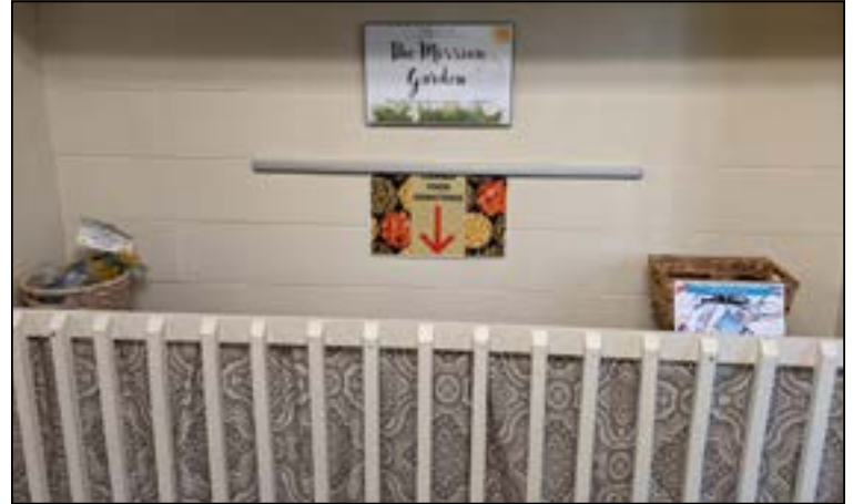
WSUMC's Mission Garden is the go-to place to drop off donations. It is located in the back hallway across from Threatt Hall.

The newest calls for donations are from two sources. The first is an ask for donations of eyeglasses for both children and adults from the United Methodists of the Midlands— Glasses for Guatemala . Information about this mission was recently published in the most recent issue of The Advocate . Glasses for Guatemala is a project of the Columbia District Outreach Committee and will continue through Sept. 30. WSUMC is