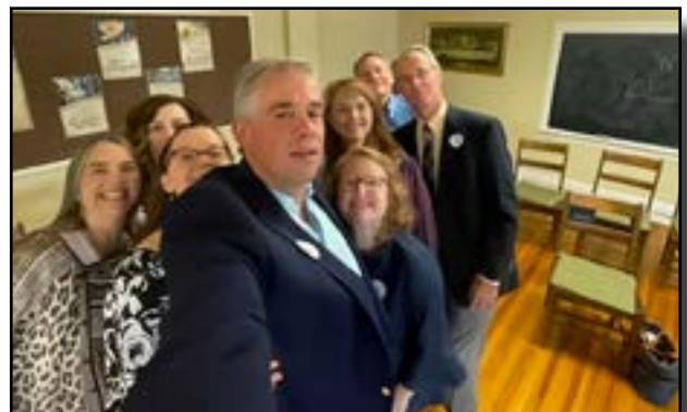
The Joy Class is all smiles about coming back to in-person Sunday School!