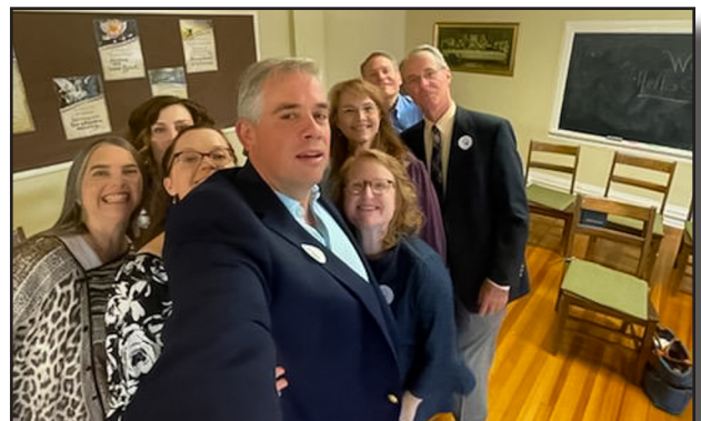
The Joy Class is all smiles about coming back to in-person Sunday School!