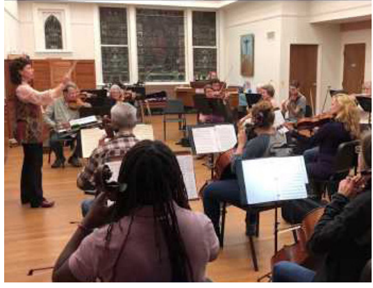
THE PALMETTO CHAMBER ORCHESTRA