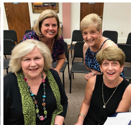
DIRECTORS OF SHE SINGS