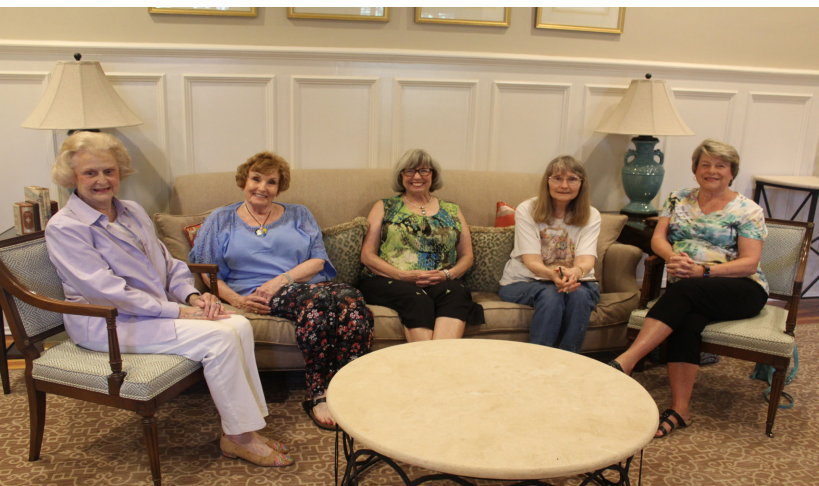
Pictured Above: Several Members of UMW Executive Committee

We also welcome any woman who has a passion for missions and fellowship to join us at any of our circles. A listing of circles, dates and locations is located on the UMW Bulletin Board next to the elevator.