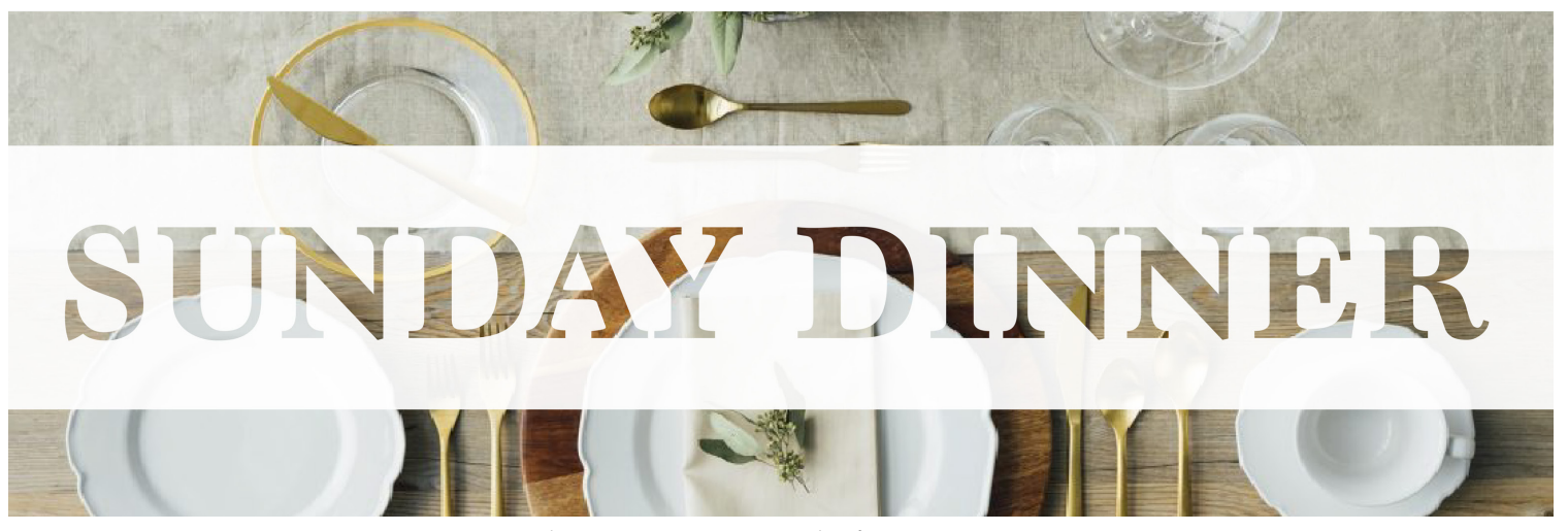
Sunday, January 27th from 4 - 6 PM

1401 Washington Street - Columbia, SC - 29201